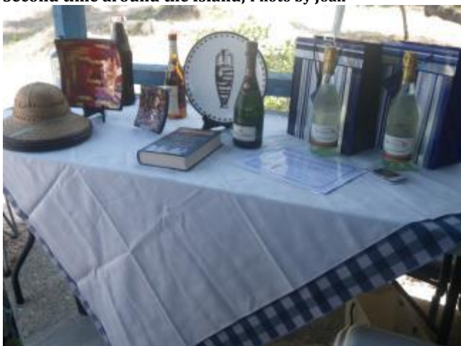
Sharons Prizes galore for the lucky few.