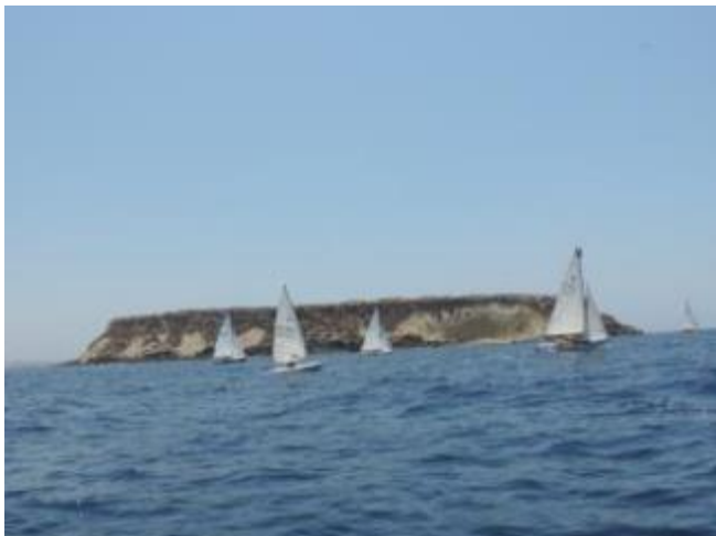
Second time around the Island; Photo by Joan