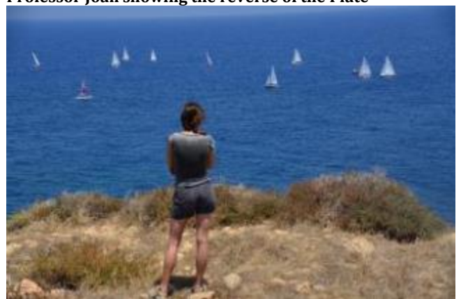
View of Race start from Yeronnisos Island