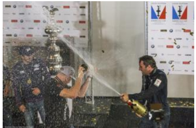
Sir Ben sprays the champagne

Royal congratulations for winner Ben Ainslie