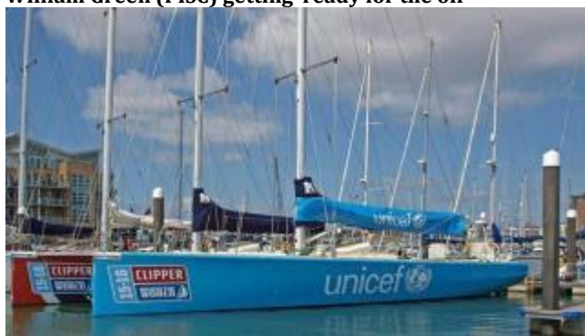
Clippers resting in their Marina