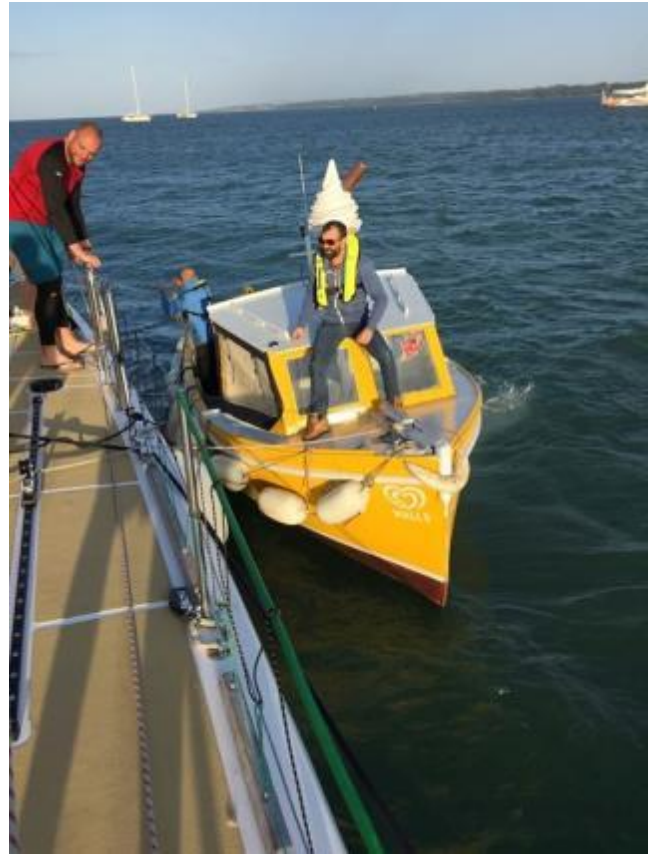
Wall's ice cream anyone? A Solent pleasure; Pull alongside and buy one!