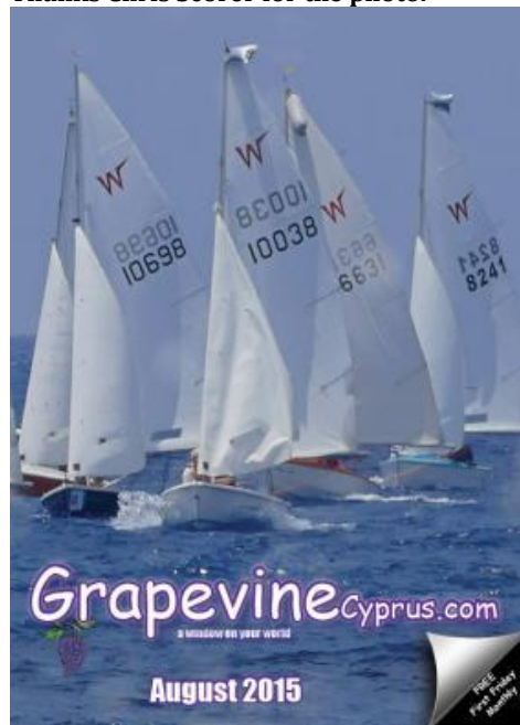
Nice cover picture of our Wayfarers