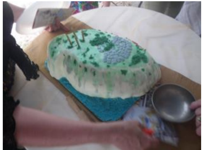
Great Yeronissos cake large enough for everyone!