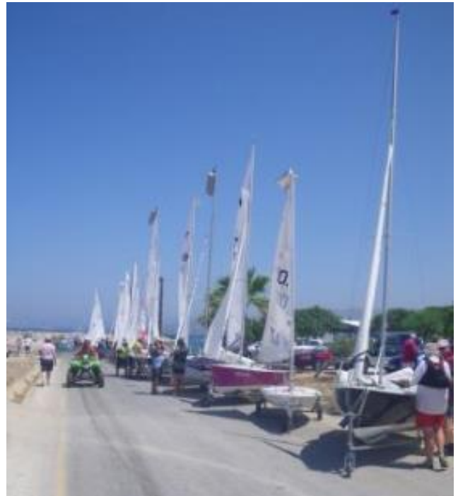
The yachts ready to launch for the Yeronissos Plate Race